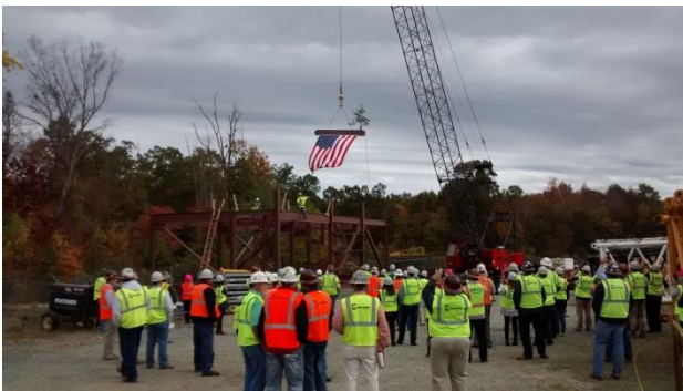
Topping Ceremony at Buckner Companies in Graham celebrating their new apprenticeship program.