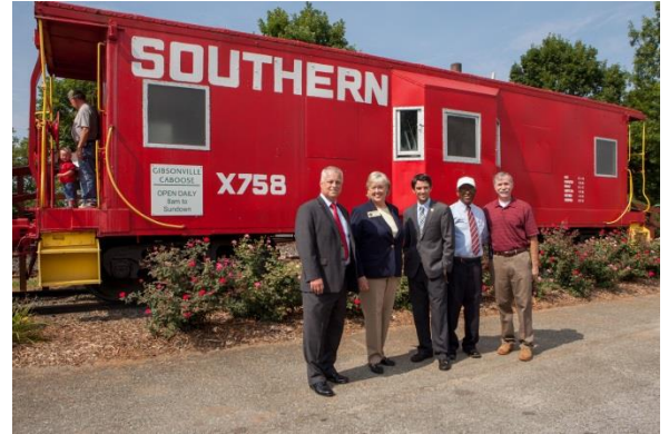
Celebrating the re-opening of the Gibsonville Caboose after a very nice makeover.