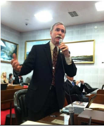
As a Chairman of the General Government Appropriations Committee I presented a portion of that budget on the House floor during the debate on the budget.