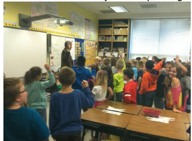
Swearing in the 3 rd grade classes of the first Sylvan Elementary House of Representatives. Wonderful teachers, young people and staff.